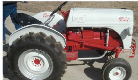
MINI Ford 8N