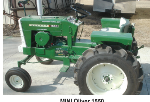
MINI Oliver 1550