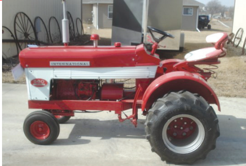
MINI IH 560 Puller

Lunch can be purchased on the grounds | Mel Hursey 402-960-2937