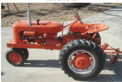
MNI Allis Chalmers WD w/plow