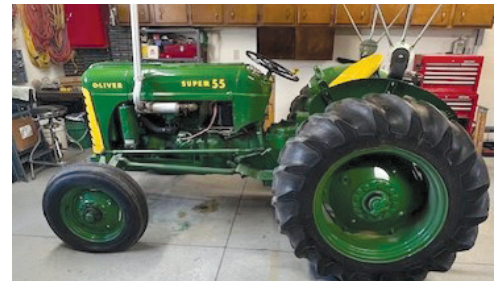
1955 Oliver Super 55