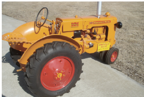
MINI Minneapolis Moline 7V