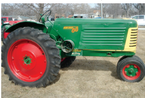
1950 Oliver Row Crop 88