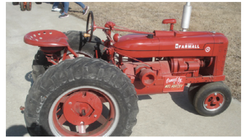
MINI Farmall H