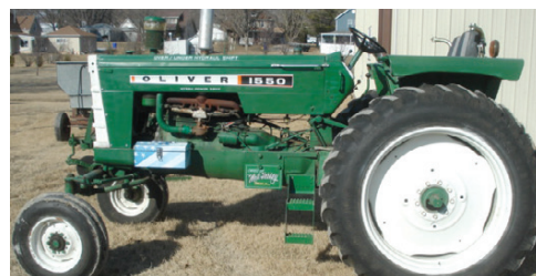
1972 Oliver 1550