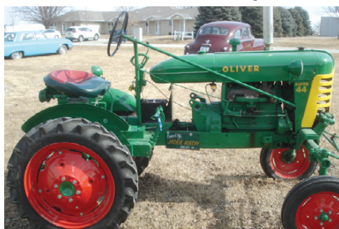
1857 Oliver Super 44