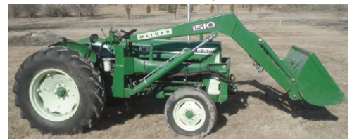
1972 Oliver 550 w/ Oliver 1510 Loader