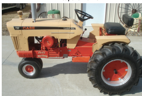
MINI Case 730 Comfort King