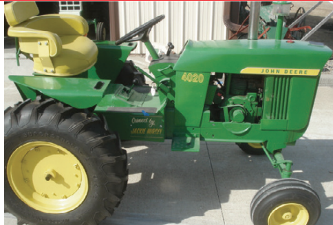
MINI JD 4020