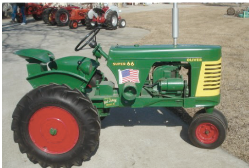
MINI Oliver 66