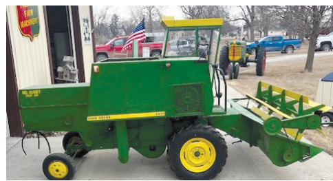
MINI JD 4400 Combine