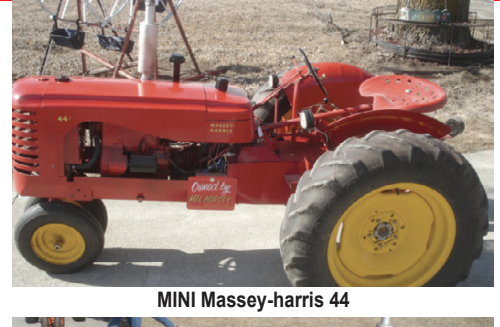
MINI Massey-harris 44